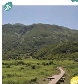
The Tadewara Marsh and Kuju Bogatsuru are registered under the Ramsar Convention.