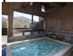
The Hokke-in Hot Spring Resort